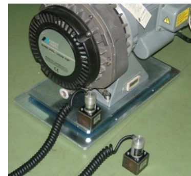
Under vibration measurement