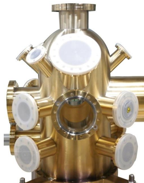
TiN coating to Mu metal chamber