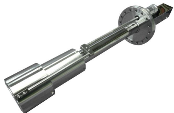
3-inch splutter gun

※ Refer to another page for special sputter gun.