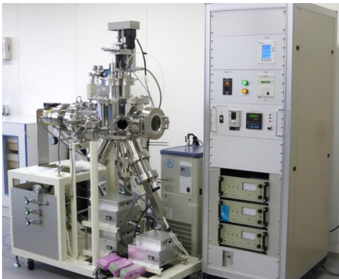
Ternary Sputtering equipment for 2-inch substrate