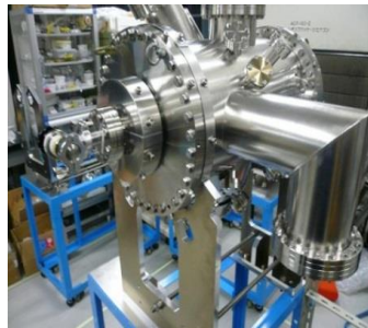
Mu Metal UHV Chamber @ SPring-8