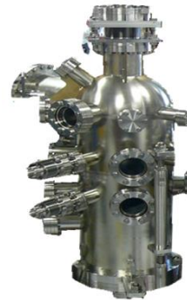
Mu metal UHV Chamber @ AichiSR